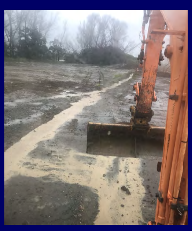
Machine Operator & Short Course Training Workshops